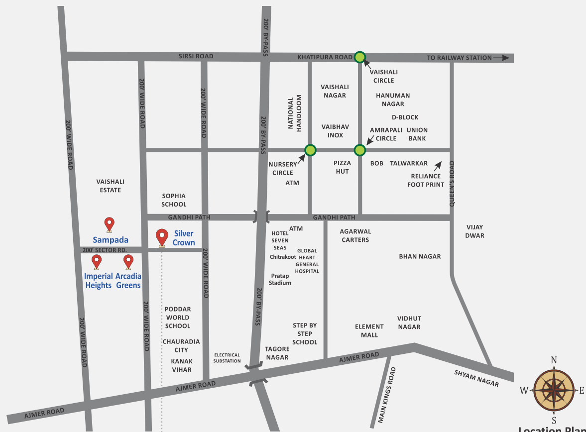
Location Plan Not to scale

A secured, luxurious lifestyle awaits you... 2 & 3 BHK FLATS & PENT HOUSES