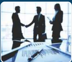
Fair & Transparent Deal