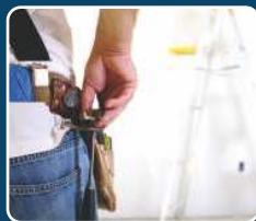
In House Maintenance