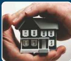
After Sales Service