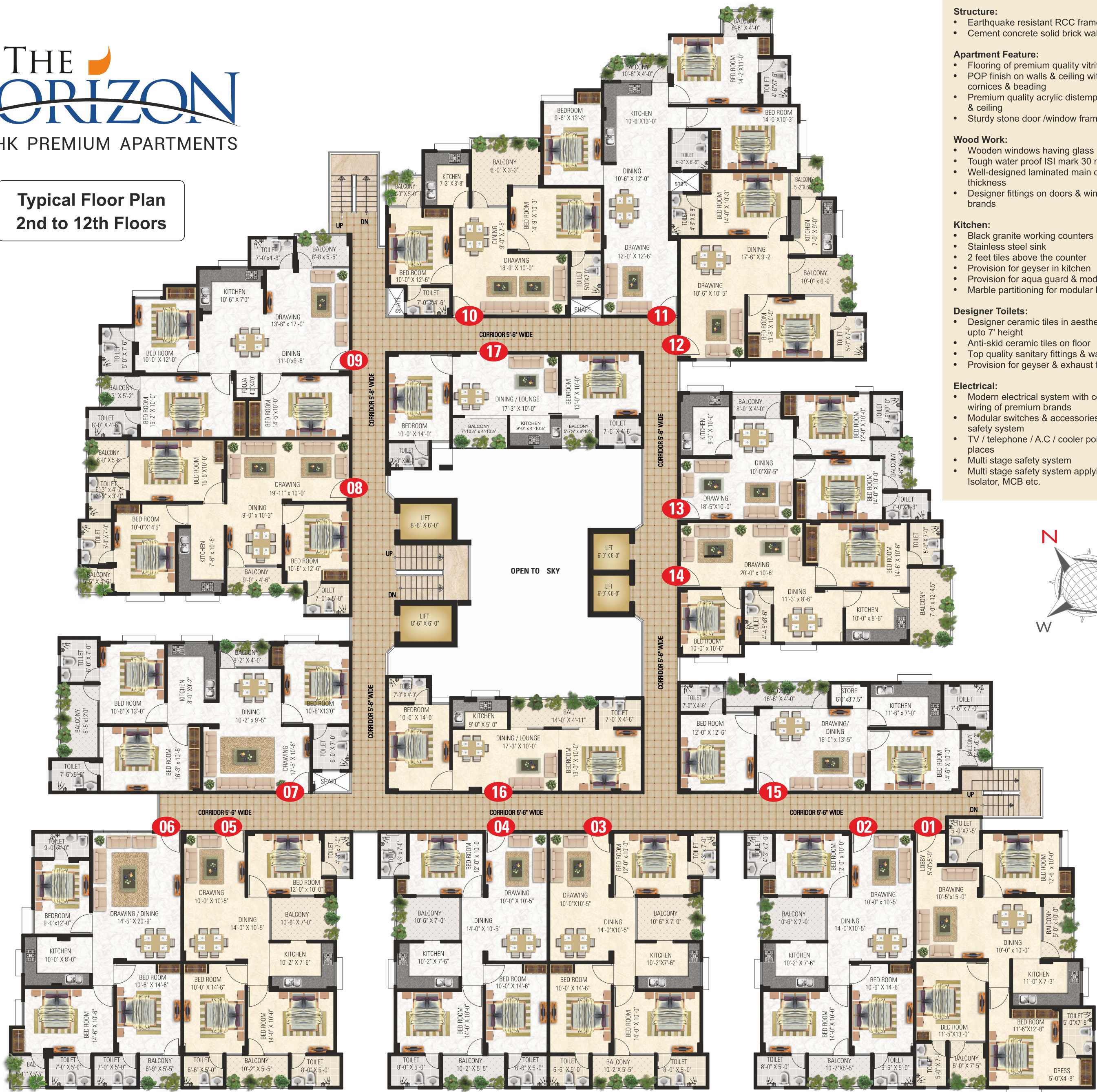
Typical Floor Plan 2nd to 12th Floors