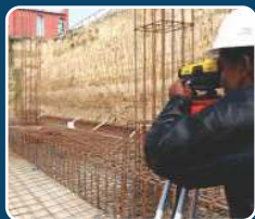
Award Winning Construction