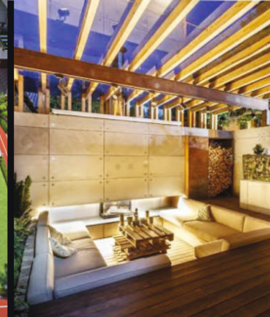
Senior Citizen Corner

Assured to have a hearty welcome with bountiful sculpted greens