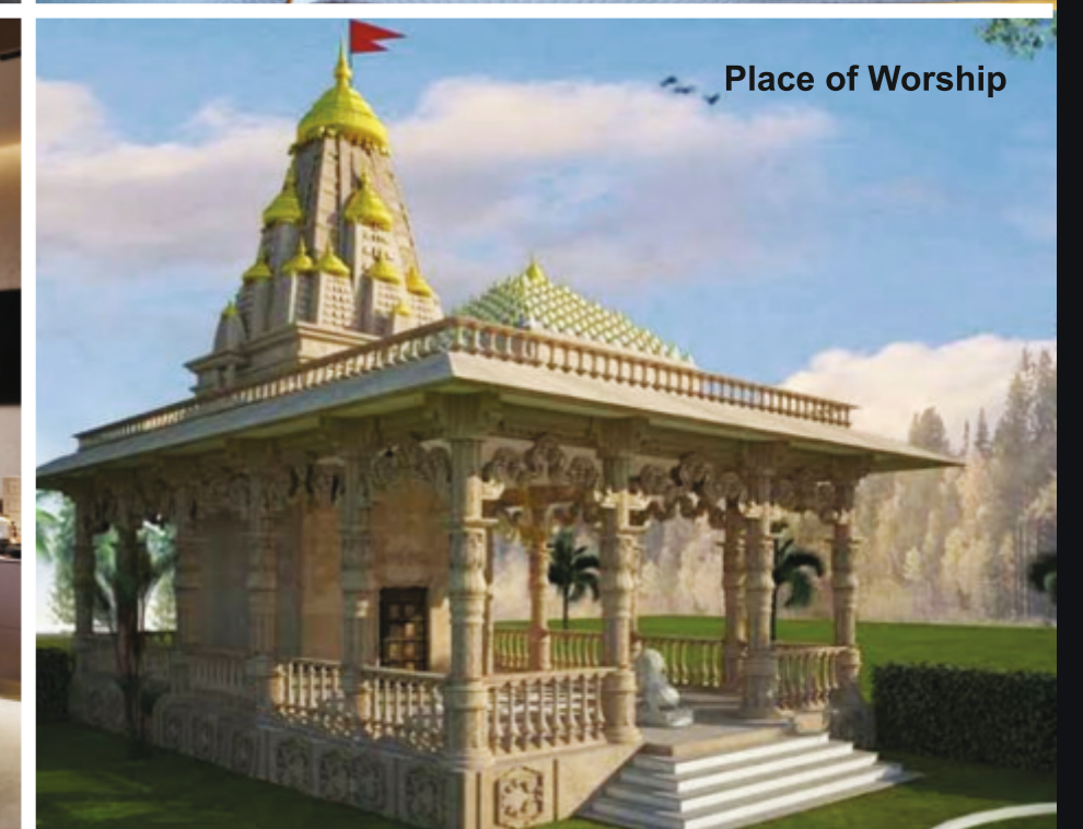
Place of Worship