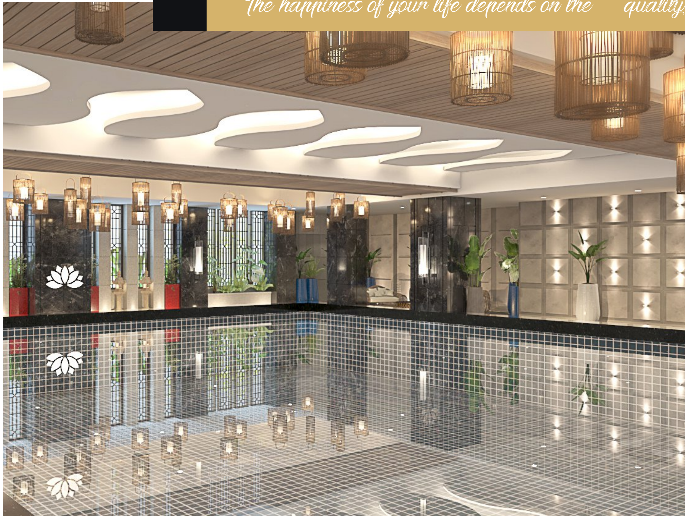
Lavish Covered Swimming Pool at Ground Floor Level