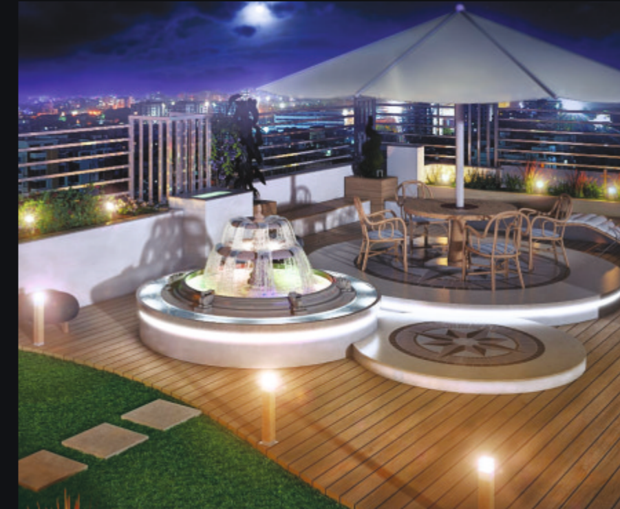
Roof Top Party Area