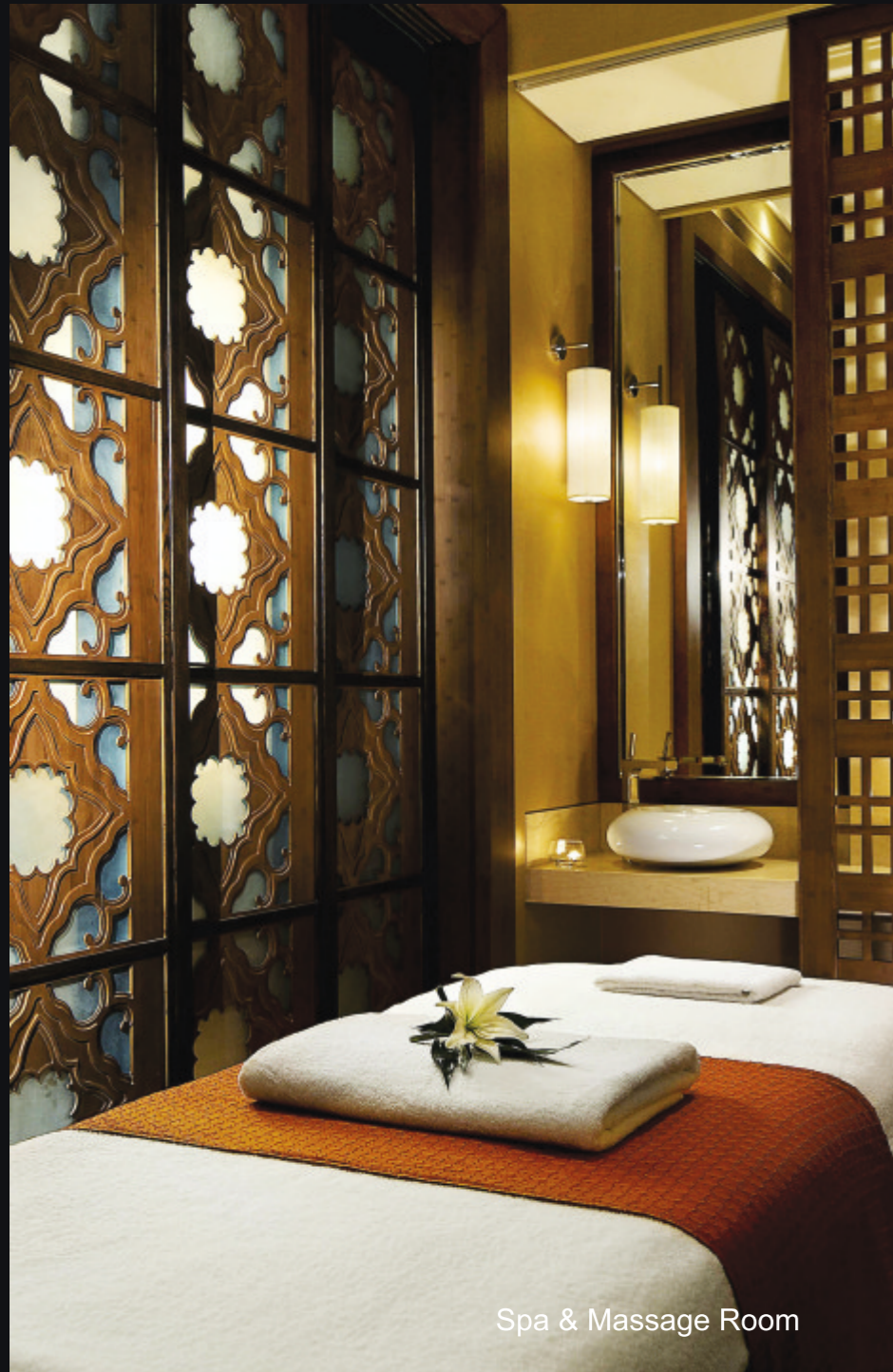
Spa & Massage Room