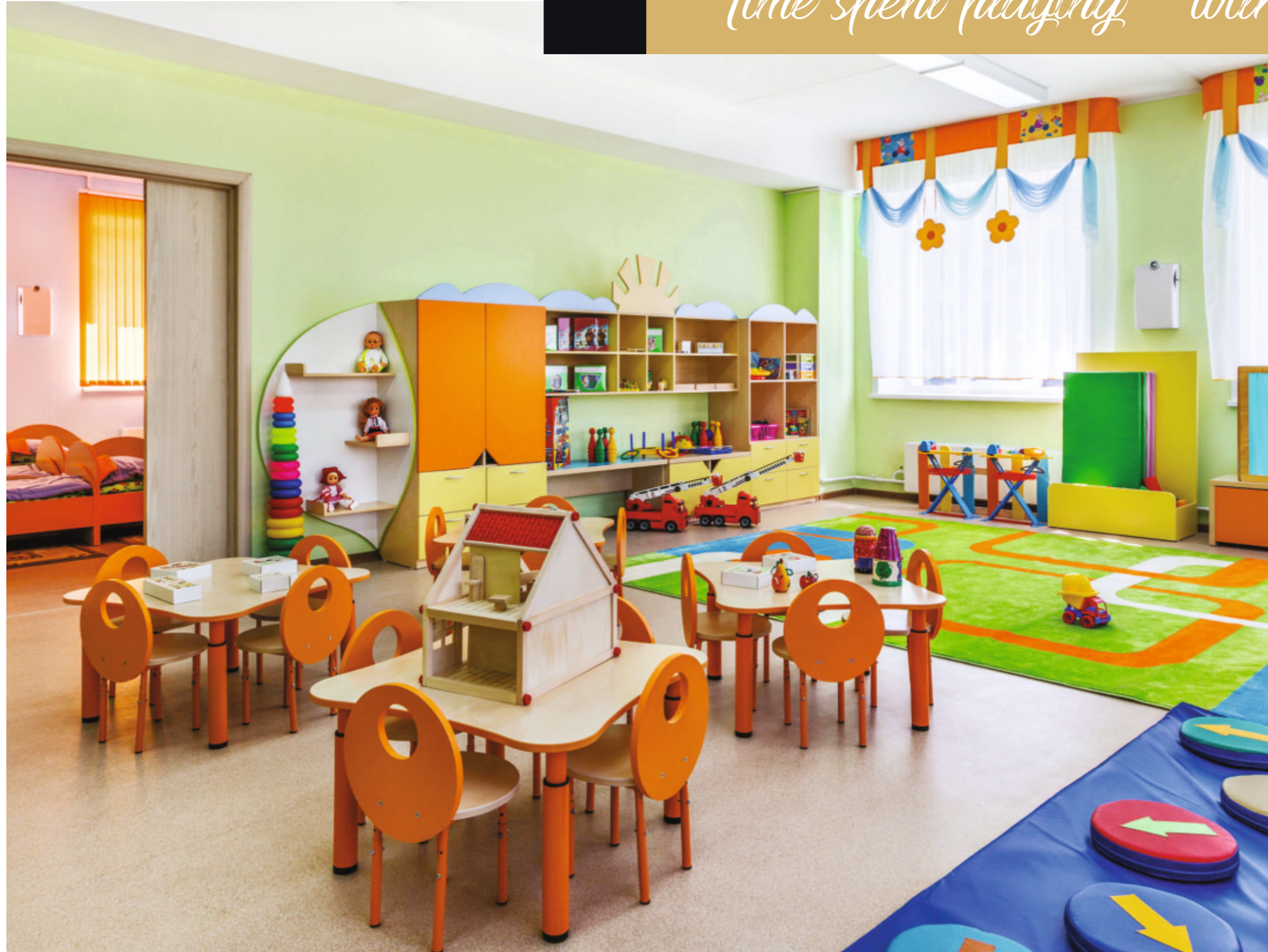
Kids Club House