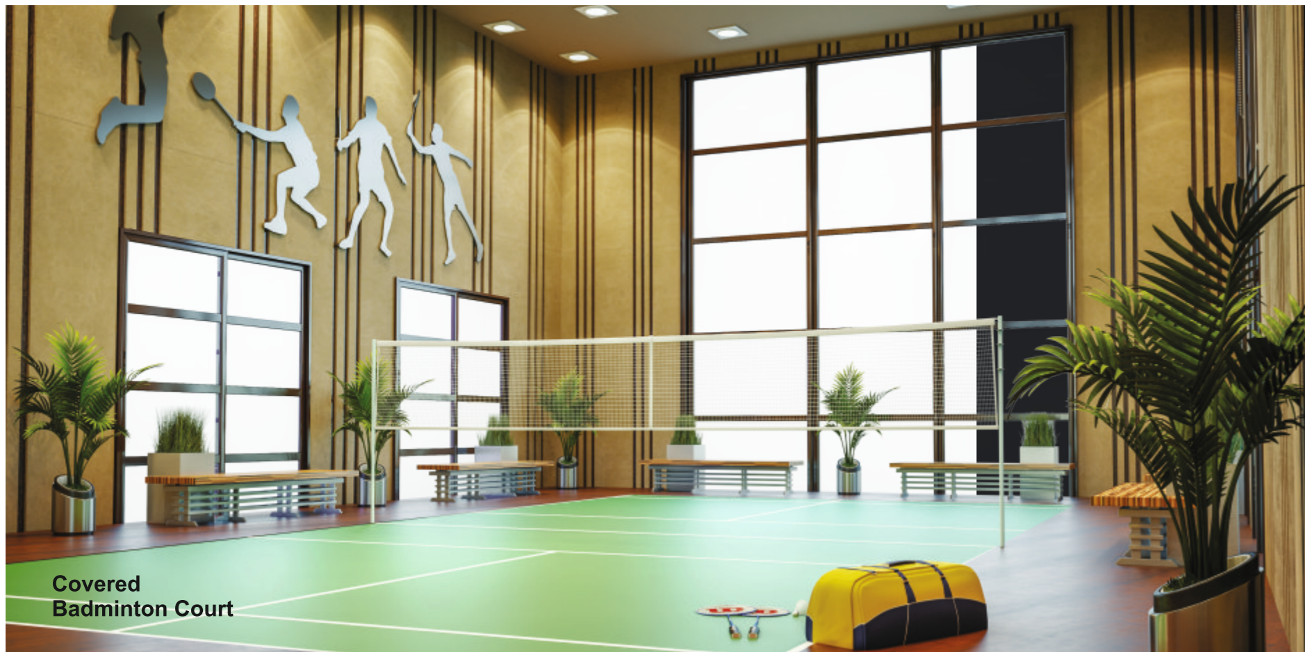
Covered Badminton Court