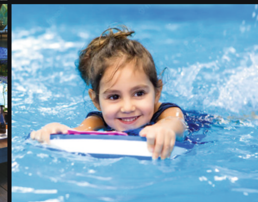
Covered Toddler's Pool